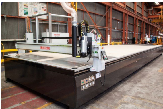
New custom-made CNC flatbed router at BlueScope Distribution Melbourne

Please click here to download imagery for use.