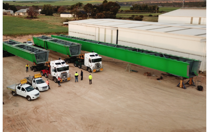
R2P Road Project - Bridge Girders “The first girder segments ready to leave the manufacturing site”

“ We proudly promote the use of Australian steel and we’re pleased to contribute to the sustainability of our local mill. ”