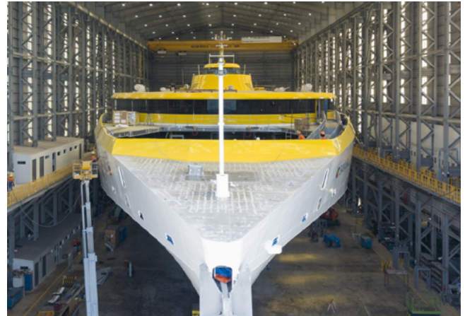
Austal - Fred Olsen Trimaran Ferry

Some readers may not be up-to-date on the world's largest aluminium ship builder. And may not realise that we are referring to a highly successful Australian organisation with corporate headquarters in Henderson, Western Australia.