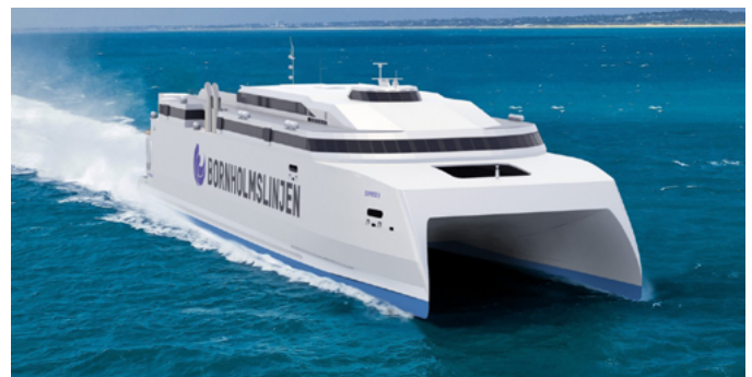
Austal - Molslinjen Express 5 Ferry