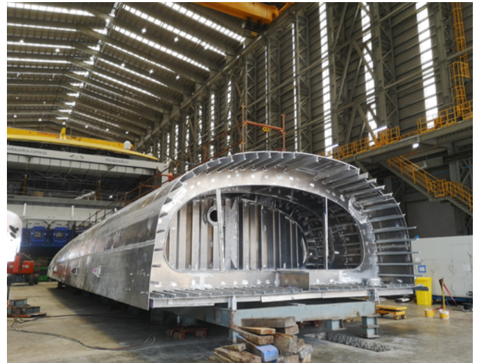
BlueScope Distribution provided a single source of supply for steel & aluminium

In the 21st century, Austal’s extensive product range includes passenger and vehicle-passenger ferries, patrol boats, high speed support vessels, surface combatants and revolutionary, multi-role vessels. As well, it is an established provider of worldwide vessel maintenance and management services. In all of this, BlueScope Distribution is a long-term and trusted partner, playing a unique role as a successful Australian company helping another Australian success story.