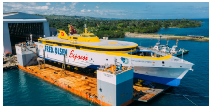
Austal - Fred Olsen Trimaran Ferry