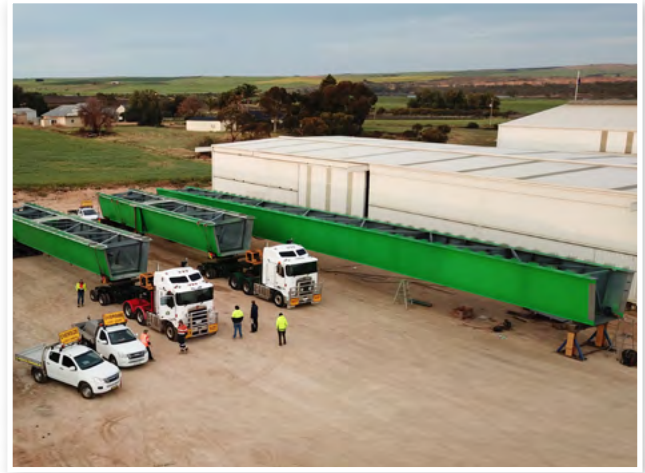
R2P Road Project - Bridge Girders "The first girder segments ready to leave the manufacturing site"

With the arrival of the COVID-19 global pandemic in Australia in 2020, businesses had to adapt quickly. They needed to work differently to keep their people safe. They also gained a heightened appreciation for trusted partnerships and dependable supply. Foreign supply chain disruptions early in the pandemic reminded us of our vulnerability as an island nation.